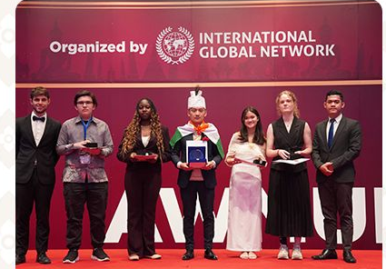
Closing ceremony & Cultural Night